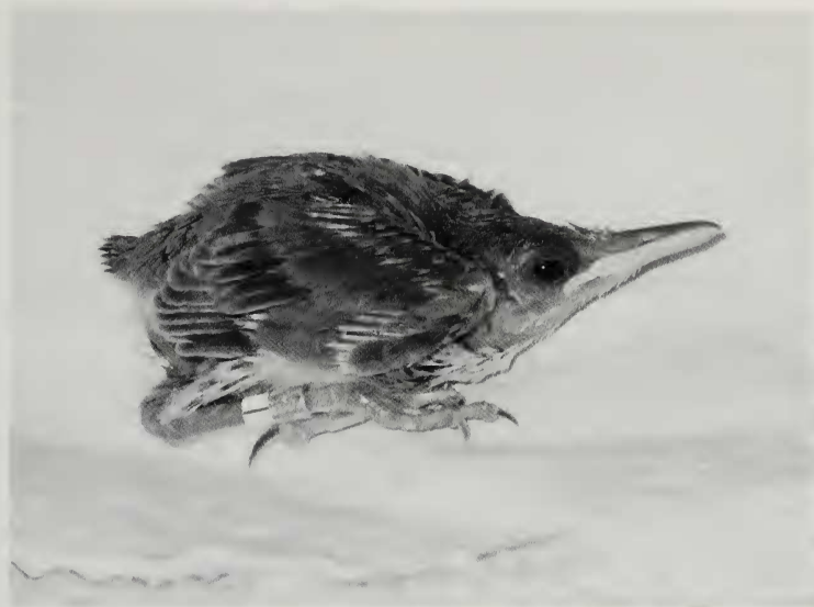
FIG. 4. Nightingale Reed-Warbler ( Acrocephalus luscinia ) nestling at day 12, Saipan, 7 October 1997.

spots just below the tongue spurs. Legs and toes were grayish blue and foot pads yellowish, with strong well-developed claws black above and yellowish below. The iris was brownish. The egg tooth was still present on the tip of the bill 2–3 days prior to fledging. Nestlings lacked the pale yellow supercilium and black lores present in the adult plumage.